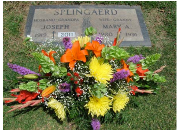
Figure 15. Joseph and Mary's Tombstone