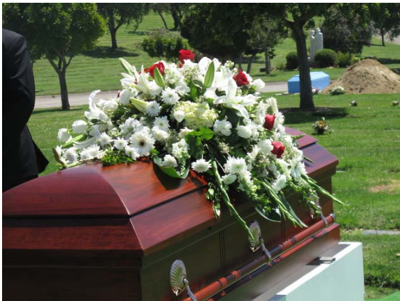
Figure 8. Casket at the Cemetery