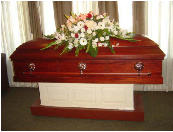
Figure 1. GrandPa's Casket