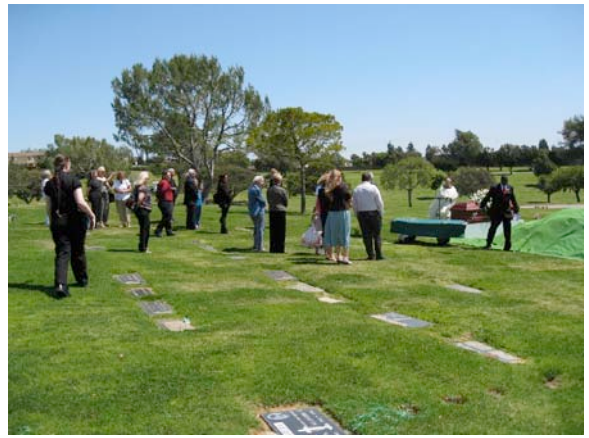
Figure 10. Arriving at the Cemetery