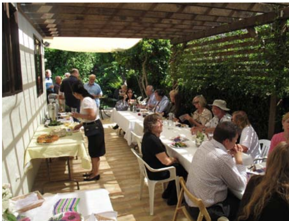
Figure 14. The Riva's hosted the Reception