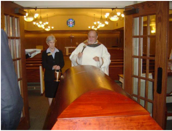
Figure 2. The Blessing of the Casket