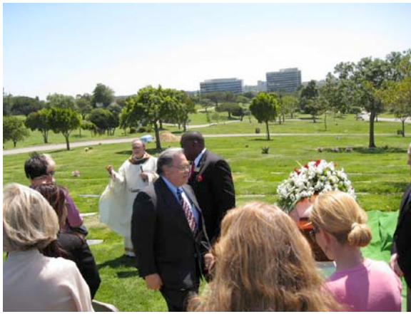
Figure 13. Departing the Cemetery