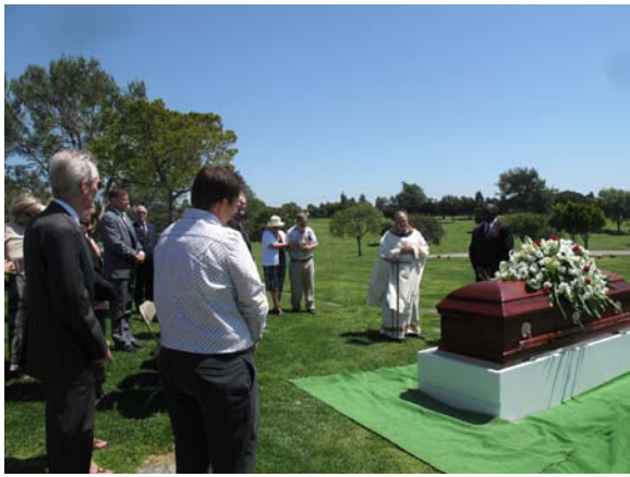
Figure 7. Service at the Cemetery