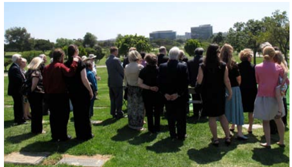
Figure 11. The Gathering at the Cemetery