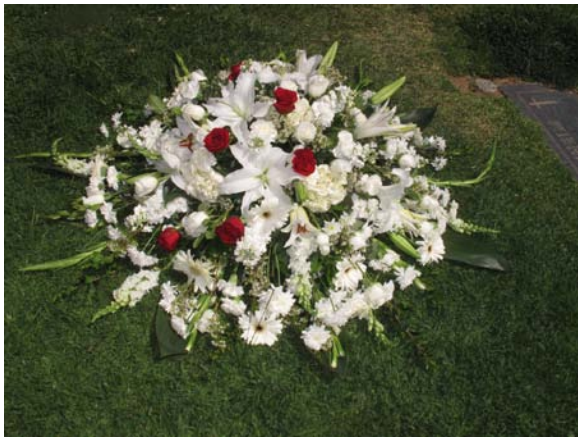
Figure 9. The Funeral Wreath